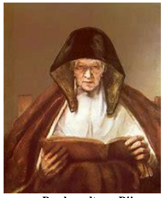
Rembrandt van Rijn