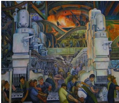
Diego Rivera, Stamping the Newsletter , Detroit Institute